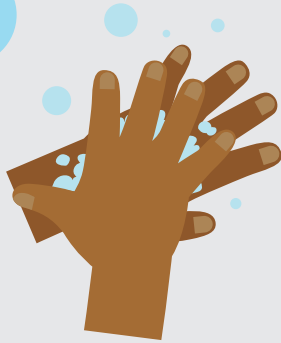
BACK TO HANDS